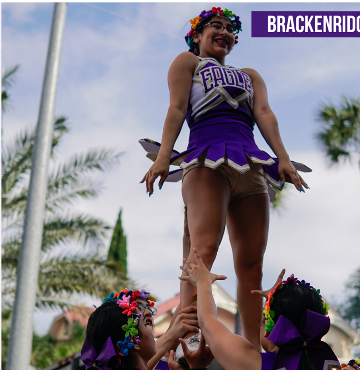
BRACK CHEER TEAM PERFORMING IN THE 2018 KWF PARADE