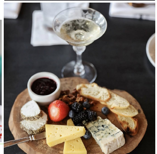
MOUTHWATERING PHOTOS COURTESY OF @BARLORETTA INSTAGRAM ACCOUNT