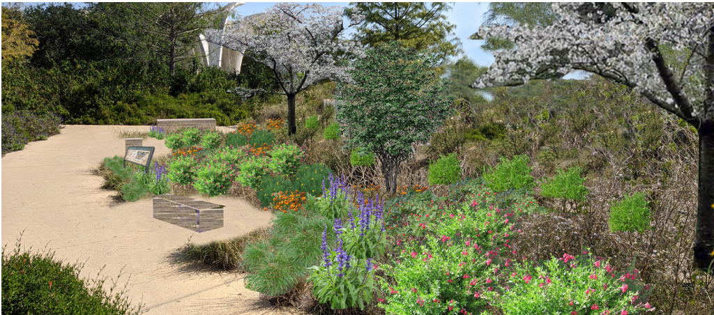
RENDERING OF THE NORTH AMERICAN FRIENDSHIP GARDEN

The extreme cold weather in mid-February may have necessitated the need to make changes in home gardens. The following website may be helpful in making decisions for those changes: BHG.com/GardenPlans