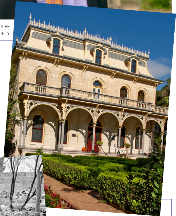
PHOTO ABOVE IS STEVES HOMESTEAD ON KING WILLIAM

Building. The Society is also known for its building awards, which grace many King William homes, its building grants, and its Heritage Education tours that have educated thousands of fourth-graders on the value that history, nature and culture in our special city! •