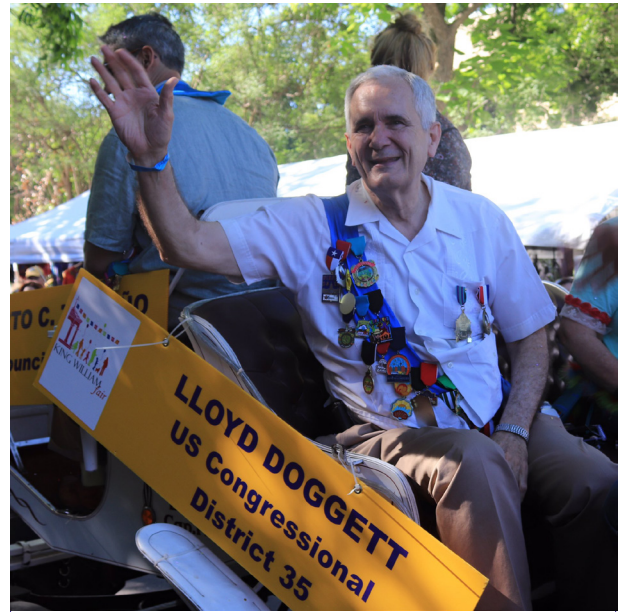
LLOYD DOGGETT IN THE 2019 KING WILLIAM FAIR PARADE

As always, please keep me advised of any fed-