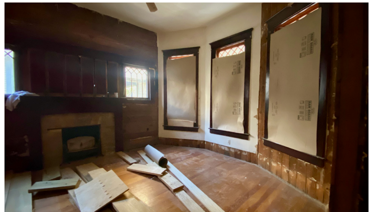
Top photo of work in progress. Bottom photo of living room under construction.

SOUTHTOWN ARTS DISTRICT THE ARTISAN CLOTHING-ART-DECOR-GIFTS 1103A S. PRESA ST - SAN ANTONIO, TX @THEARTISANATX