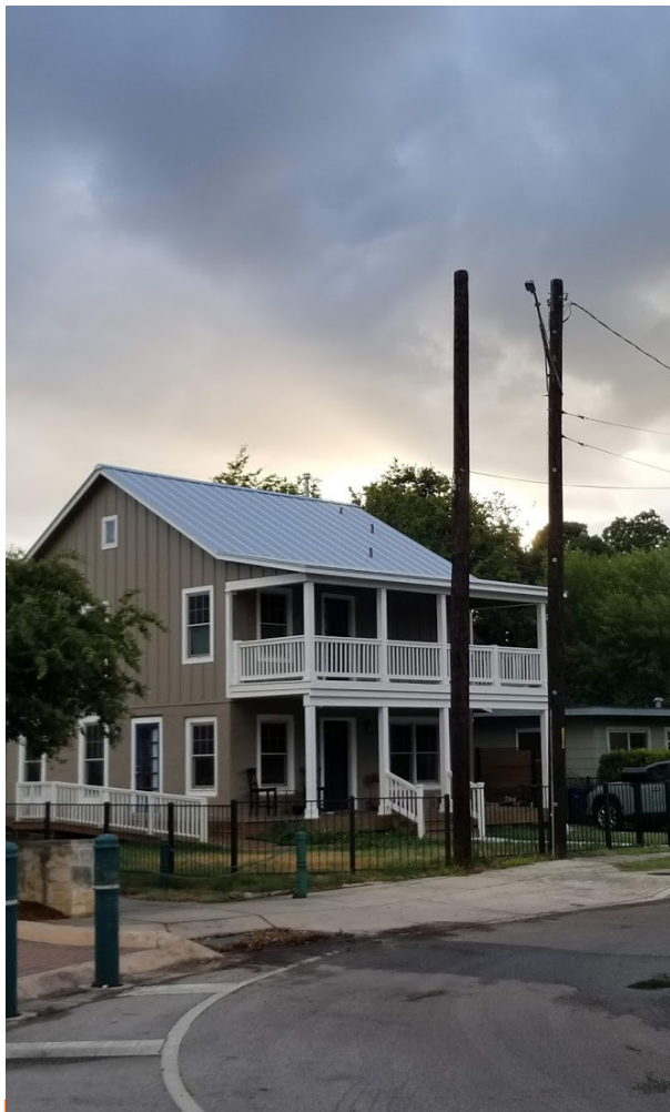
Photo of home today