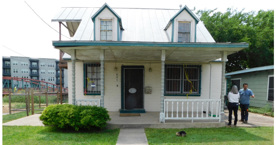
Photo of home when purchased in 1996