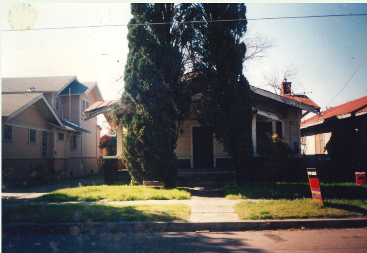
Top photo of chain originally used to hold up the front porch roof. Middle photo of home after restoration. Bottom photo of home when purchased.