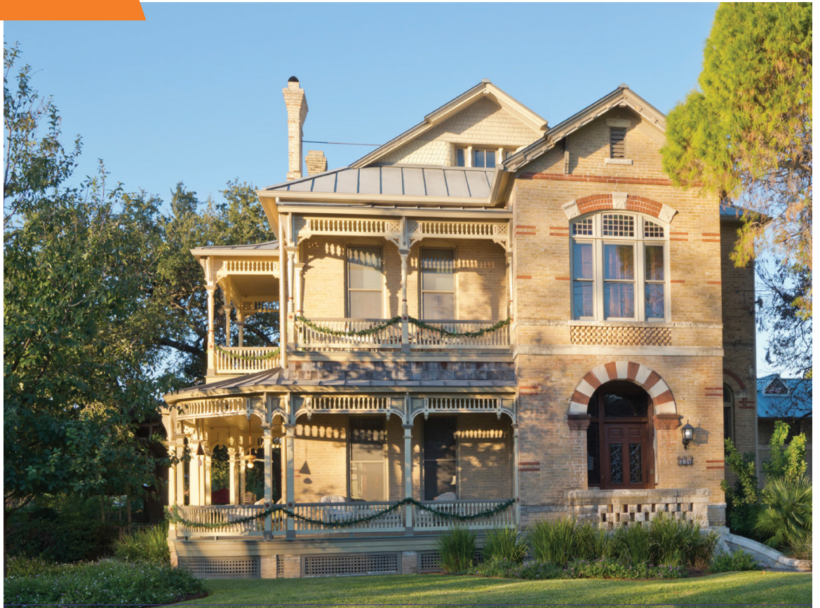
Top photo of 331 Adams as it looks today