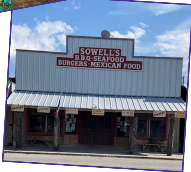
TOP TO BOTTOM, CHOKE CANYON RESERVOIR IS ONE OF THE LARGEST FRESHWATER LAKES IN SOUTH TEXAS; FAMILY-OWNED AND OPERATED RIVER RUBY BOUTIQUE; AND SOWELL'S BBQ IS IN THE OLDEST BUILDING IN THREE RIVERS.

church. St. Louis Day is celebrated on the Sunday closest to August 25, their patron saint's feast day. It is one of the best known parish celebrations in South Texas. Many historical markers have been awarded to the church, cemetery, and St. Louis Day. The beautiful church is open to visitors. Walk in and admire the majestic stained-glass windows and grand woodwork.