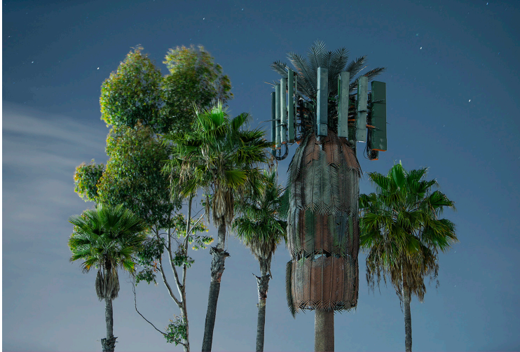
ISIK KAYA SECOND NATURE 45 X 30 INCH

July is one of our favorite summer months to take a nice break and head on vacation. Whether you are welcoming friends from out of town or taking a couple days off for a staycation of your own, Blue Star Contemporary (BSC) is the place to go for the best contemporary art in the city. To kick off this perfect summer vacation month, BSC presents new and exciting exhibitions opening on July 1. Andreas Till: De Ami focuses on the influence of the presence of American troops in artist