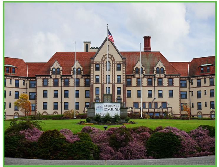
MASONIC HOME IN DES MOINES, WA

Pacific NW Magazine recently published an article about the “majestic” Masonic Home. Built in 1925-27 as a residence for elderly Masons, the property closed as a retirement center in 2005. It was then used briefly as an events complex. The Masons sought to possibly develop it, but the estimated $40 million price tag was beyond their reach so instead they sought to demolish it in 2019. They then sold the property to Zenith Properties, who have now again applied to have the building demolished. The City of Des Moines is conducting an environmental review and it triggered an advocacy alert by the Washington Trust for Historic Preservation. As one impassioned resident expressed, “It’s one of the most beautiful things in all of Puget Sound, which makes it one of the most beautiful things on the planet Earth.”