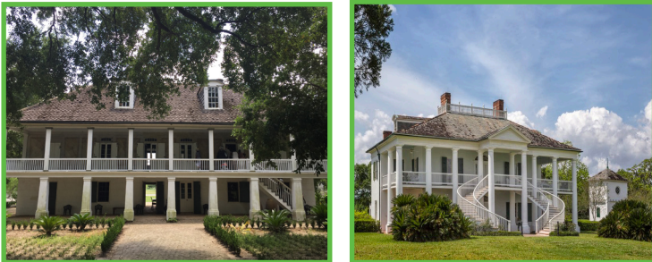
THE WHITNEY PLANTATION AND EVERGREEN PLANTATION IN WALLACE, LA

Pro Publica and Government Executive both released stories surrounding a proposed massive grain elevator project on the Mississippi. The property owners hired an archaeological consulting firm to conduct a study and prepare a report for the Army Corps of Engineers regarding the impact a project like this would have on the small community of Wallace, a predominantly African-American community and on two historic plantations. One of these plantations, the Whitney Plantation, serves as a memorial to the enslaved who were forced to work. The other, Evergreen Plantation, is a uniquely intact National Historic Landmark. Both stories have reported that the consultant prepared a report detailing the negative impacts a project of this size would have, and noted the area possibly also has some not-yet-discovered cemeteries of the enslaved that worked the land. Yet when the report was submitted by the property owner and developer, those passages had been edited out. The original author of the report, along with the Advisory Council on Historic Preservation are now insisting the Army Corps of Engineers “supplement or replace” the report provided to them by the developer.