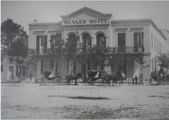
MENGER HOTEL, CIRCA 1865.