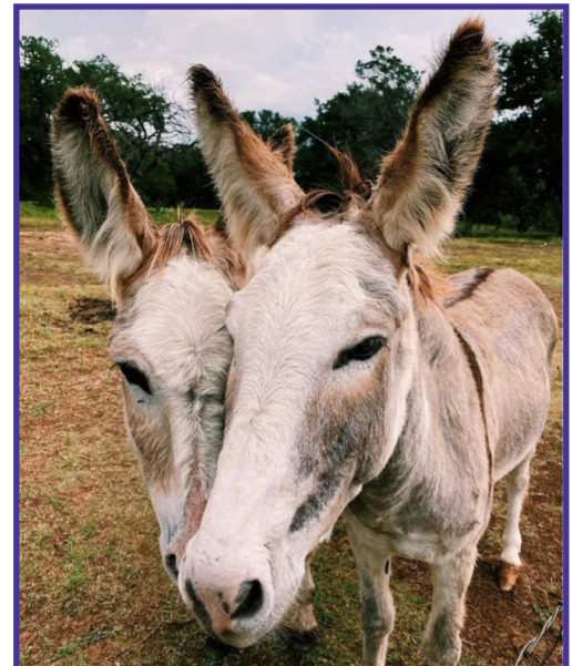
RESCUE DONKEYS RESIDING AT HYE MEADOW WINERY.