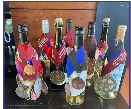
AWARD-WINNING WINES AT HYE MEADOW WINERY.

We enjoyed lunch at a local favorite, Pecan Street Brewery. Their most popular dish is the Pecan Sweet Chicken. Not only is this a customer favorite, but the staff also recommends this plate without hesitation. It’s a huge portion of a combination of sweet and savory