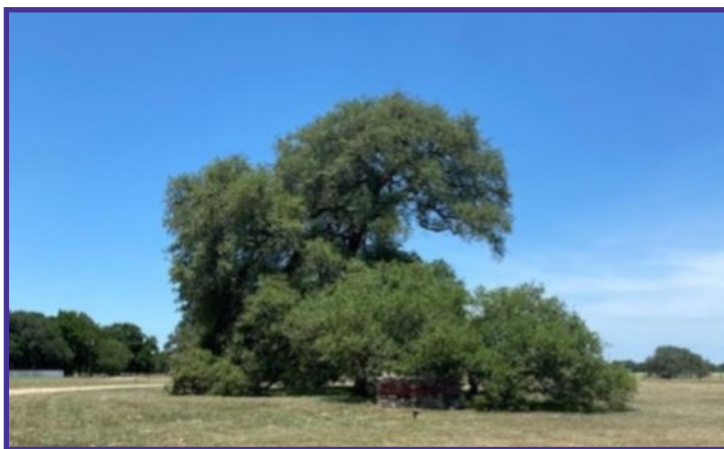
THE RUNAWAY SCRAPE OAK OR SAM HOUSTON OAK IN GONZALES, TEXAS

Choke Canyon Reservoir with 26,000 surface acres is one of the largest freshwater lakes in South Texas. It is the site of many fishing tournaments throughout the year. The state park that surrounds the reservoir is noted for its wildlife including white-tailed deer, javelina, wild turkey and even alligators. There have been sightings of bald eagles within the Choke Canyon area. Some of the largest big-mouth bass caught in Texas have been landed at Choke Canyon. Fishing