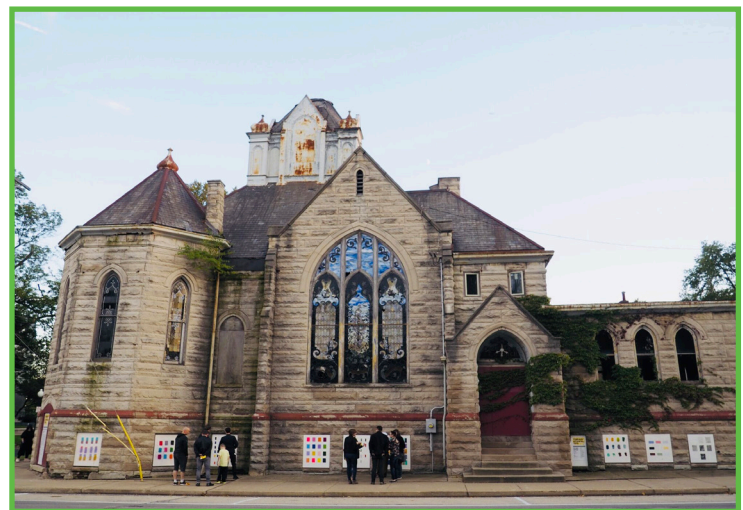
HALE MEMORIAL CHURCH IN PEORIA, IL

WCBU has reported the City of Peoria has regretfully approved demolition of Hale Memorial Church. The church, named after a local community leader, was built in 1900 and served as a church until 1999 when a devastating fire caused over $100,000 in damage rendering it unusable. Since then the property was sold three times to couples who perhaps naively thought it could be saved. The last couple then sold it to a local developer whose original plans were to restore the structure. But after an engineering study both city leaders and the developer have decided to allow the building to “die with dignity.” Plans are to salvage stone from the church to reuse in the gardens and park they plan to create on the vacant lot.