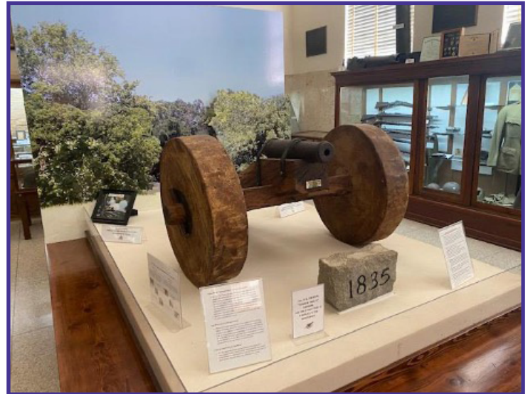
THE "COME AND TAKE IT " CANNON AT THE GONZALES MEMORIAL MUSEUM

to the Gonzales Memorial Museum, a driving tour of Historic Gonzales, and a tour of the Gonzales County Jail Museum are all must sees when visiting Gonzales. About 8.5 miles outside of Gonzales sits the Sam Houston Oak. Folklore has it that under this tree is where Sam Houston received the news that the Alamo had fallen and defenders were killed.