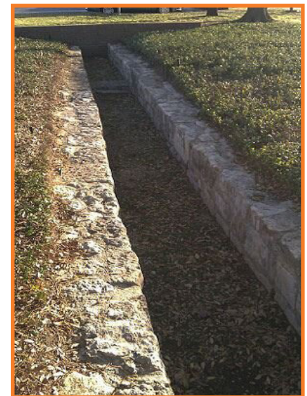
PORTION OF THE ACEQUIA TODAY