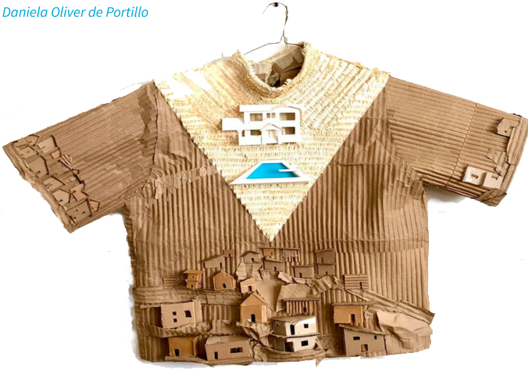
JUAN CARLOS ESCOBEDO, SHIRT, 2021. CARDBOARD AND CUT PAPER.

As you start to prepare your yards and garden beds for the coming warmth and make plans to enjoy San Antonio's bountiful opportunities for outdoor fun, don't forget to cultivate your love for the arts with Blue Star Contemporary (BSC).