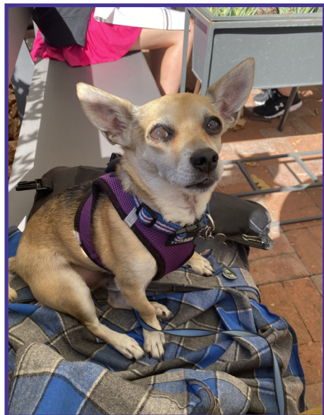
LEIGH ANNE LESTER'S DOG "NOLI"