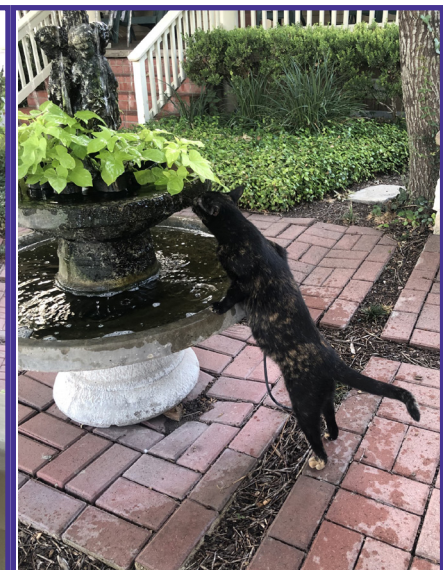
SHAWN CAMPBELL'S CAT "CIRILLA"