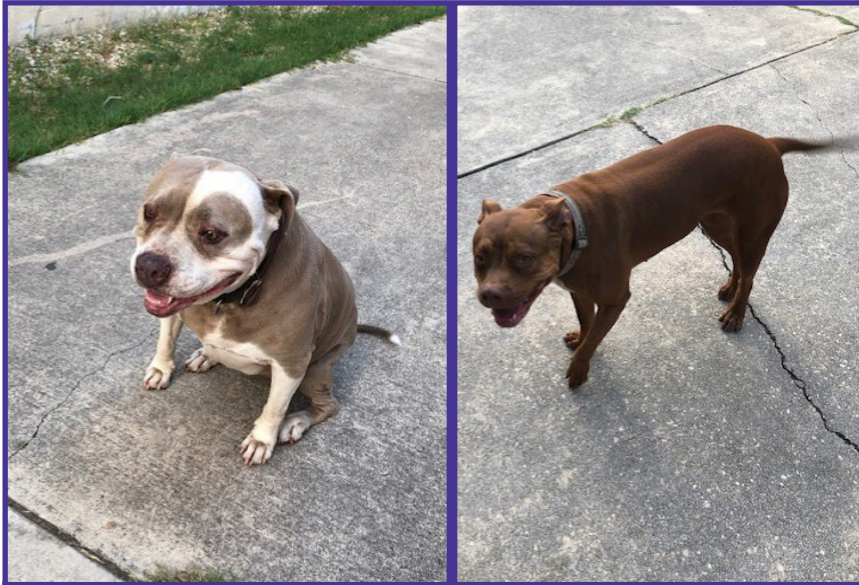
TINA GARZA'S 10 YEAR OLD PURE BRED PIT BULL "AMY" (LEFT); AND NOT QUITE TWO YEAR OLD AMERICAN RED NOSE PIT BULL "COCO" (RIGHT)