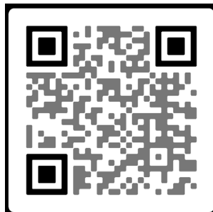
Table Sponsorship & Individual Tickets Available!