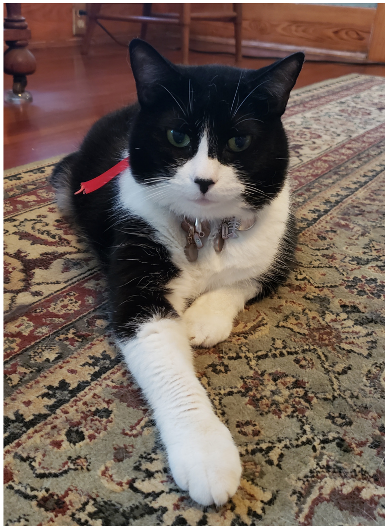
ALAN'S TUXEDO CAT "BOOTS" POSING FOR THE CAMERA