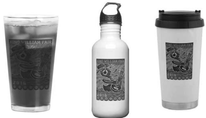
KW Fair logo products